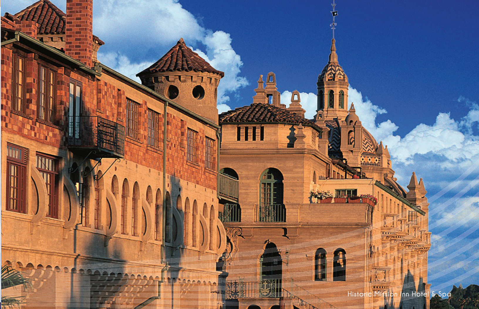
Historic Mission Inn Hotel & Spa